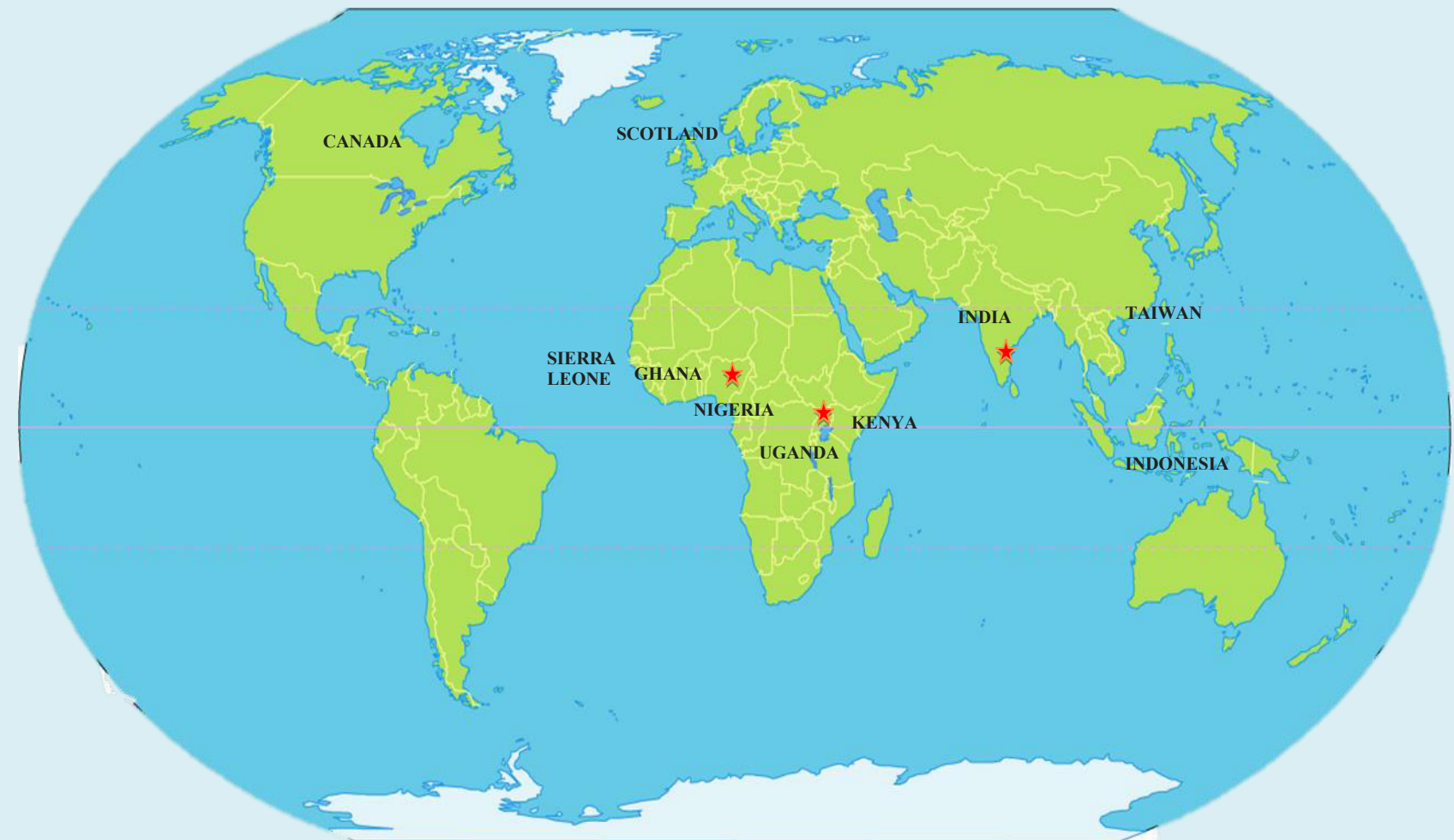
MFM 2014 candidates attending the First Contact Program

For enquiries email to mfm.icmda@gmail.com family.med@icmda.net